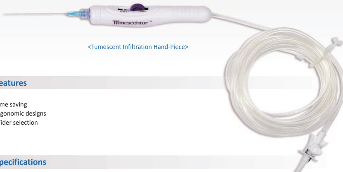
<Tumescent Infiltration Hand-Piece>